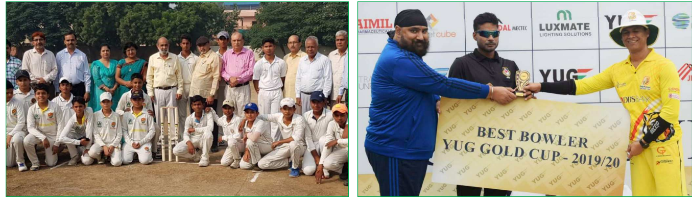
U14 Cricket Team