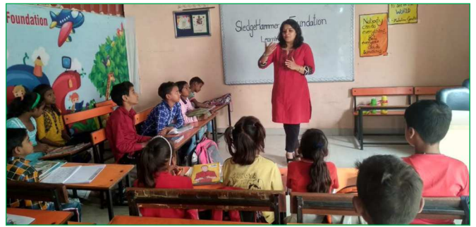
Community Library project with DPS, Greater Faridabad