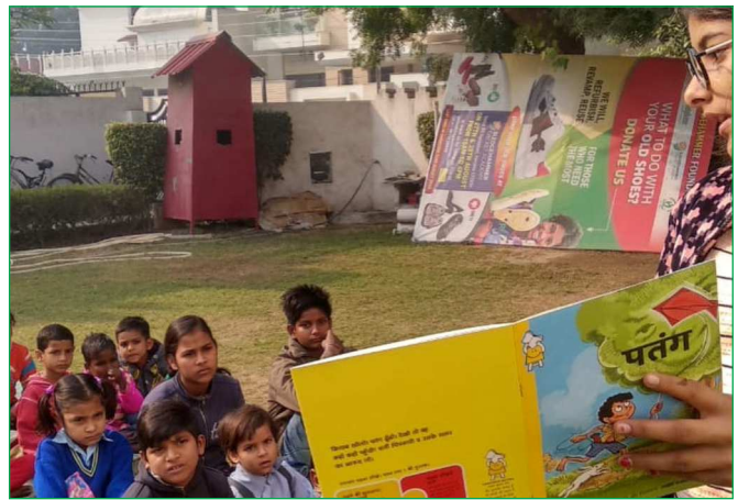
Community Library Project with DPS, Greater Faridabad