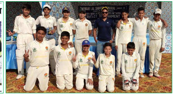
Achievement of U-14 Team at SHCA