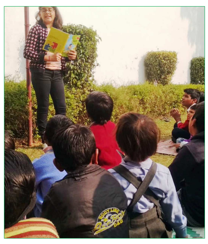
Community Library Project with DPS, Greater Faridabad